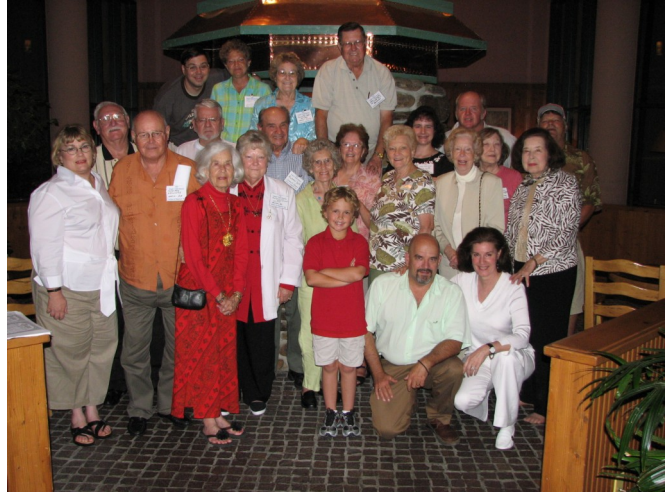
2008 Reunion Attendees at Cabot Lodge (Ridgeland MS)

On Saturday night, we met for our dinner at the Chimneyville Smokehouse Restaurant near the Jackson Coliseum & Fairgrounds. A former train depot, the restaurant was the perfect venue as we had the place all to ourselves that night. We enjoyed a buffet of barbecued chicken and pulled pork, followed by our meeting. There was some drama that night with a minor fender bender on the way to dinner. There was also a bit of breaking & entering and burglar alarms at the restaurant after dinner. We won't name names, but if you ask nicely, I'm sure someone from Mobile will tell the story!